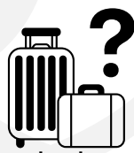
Leaving belongings unattended in bathrooms or waiting areas